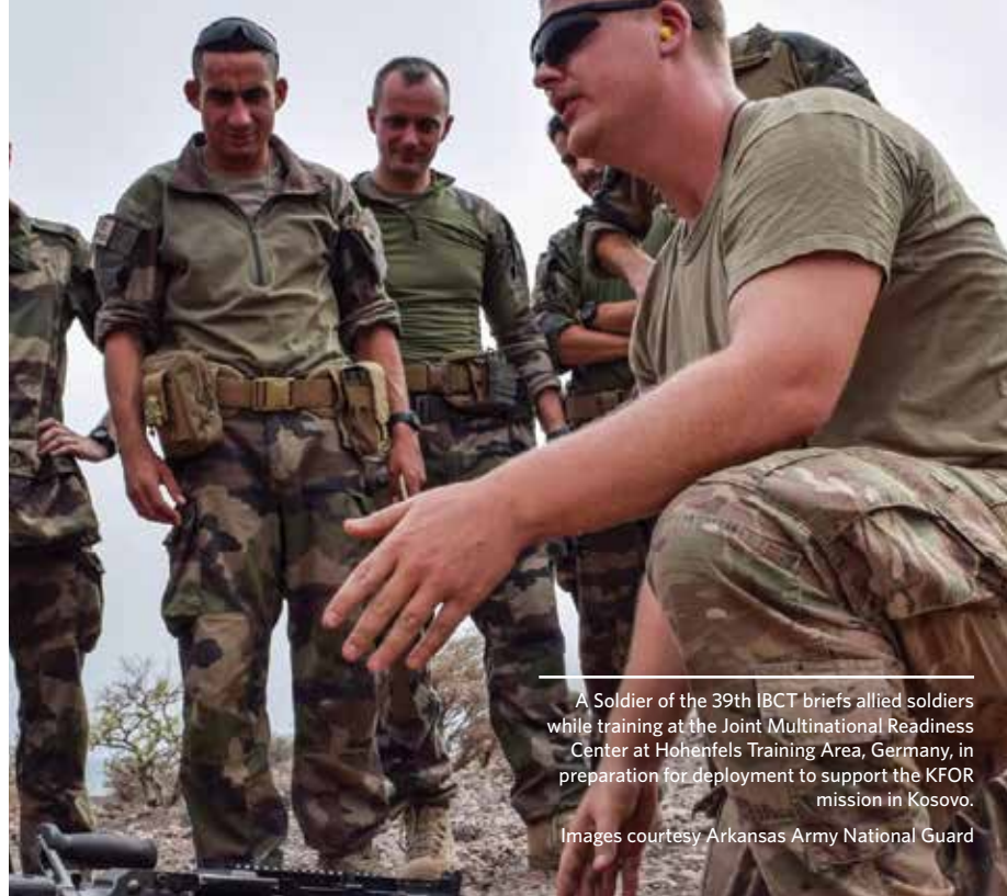
A Soldier of the 39th IBCT briefs allied soldiers while training at the Joint Multinational Readiness Center at Hohenfels Training Area, Germany, in preparation for deployment to support the KFOR mission in Kosovo.