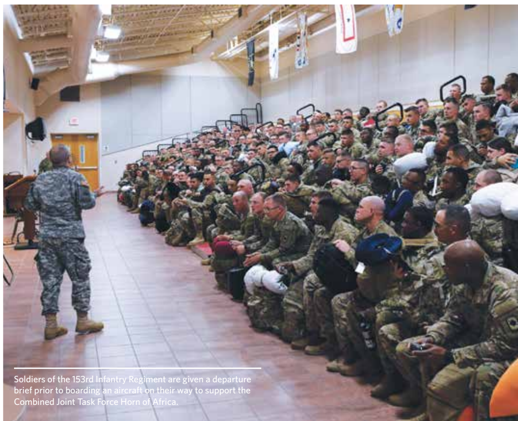
Soldiers of the 153rd Infantry Regiment are given a departure brief prior to boarding an aircraft on their way to support the Combined Joint Task Force Horn of Africa.