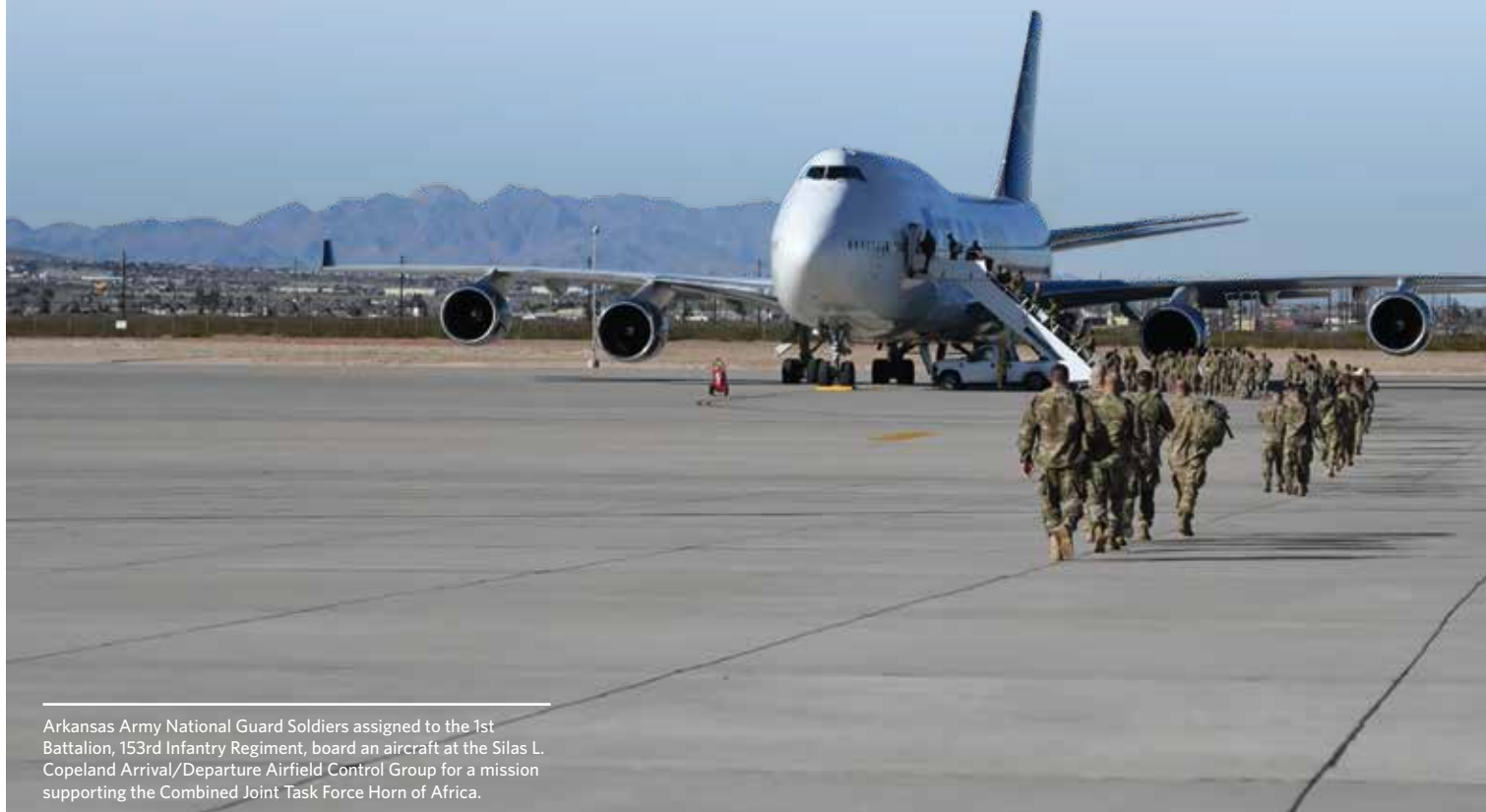
Arkansas Army National Guard Soldiers assigned to the 1st Battalion, 153rd Infantry Regiment, board an aircraft at the Silas L. Copeland Arrival/Departure Airfield Control Group for a mission supporting the Combined Joint Task Force Horn of Africa.