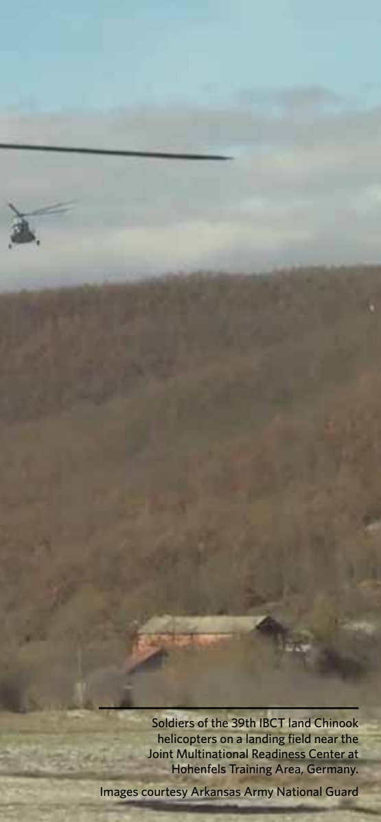
Soldiers of the 39th IBCT land Chinook helicopters on a landing field near the Joint Multinational Readiness Center at Hohenfels Training Area, Germany.