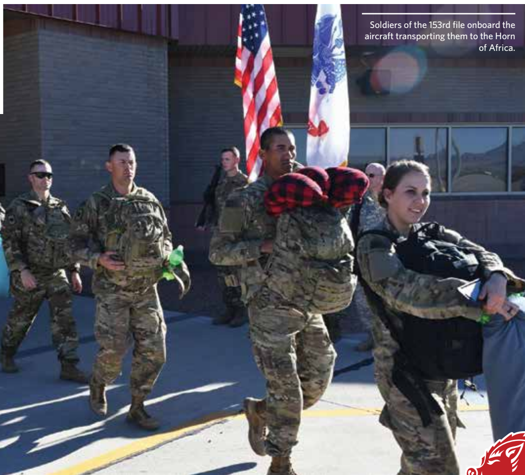
Soldiers of the 153rd file onboard the aircraft transporting them to the Horn of Africa.